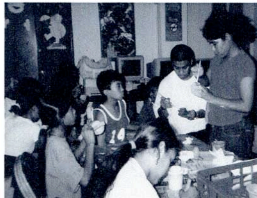
AYS participants concentrate on their arts & crafts

Growth-enriching services are also available through AYS. Collaborative relationships with parents, teachers, counselors and other professionals are maintained by the executive director for each participant. The goal for AYS is that every child receive integrated and coordinated support and positive reinforcement so they might realize their ultimate potential. Advocacy in the juvenile justice system, community service commitments, life skills training and academic scholarships are invaluable supports provided by AYS. Some of the program participants attend the finest private schools in Chicago. Several students are currently enrolled in four-year University programs!